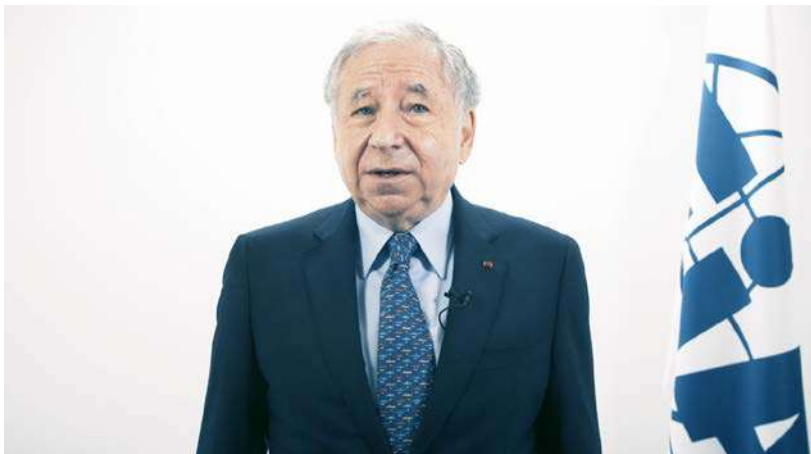
Mr. Jean Todt. President of the FIA, International Automobile Federation, UN Ambassador for Road Safety.

“The example of Mollet should encourage us and serve as a model to continue working on the reduction of accidents”